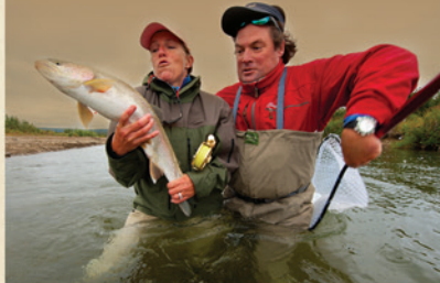
Field Notes 2013

Thank you for your support by referring Crystal Creek Lodge to your friends!